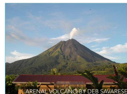
ARENAL VOLCANO