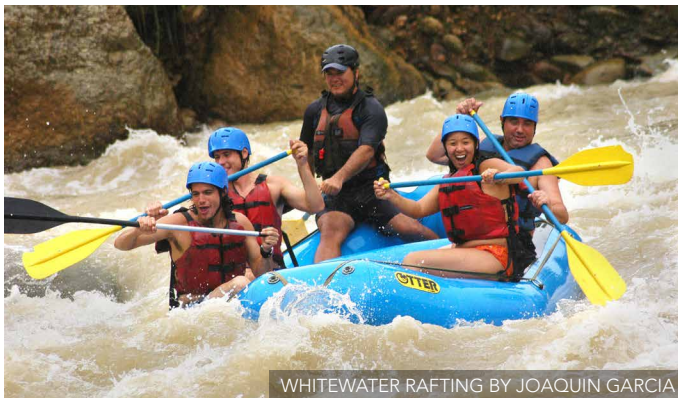
WHITEWATER RAFTING

This morning after breakfast, learn about Costa Rica's biodiversity during an informative presentation given at the hotel by a local expert. Depart San José and travel to Selva Verde Lodge & Rainforest Reserve, located in the lush lowlands of northeastern Costa Rica. En route visit the nearby frontier town of Puerto Viejo. Learn about a local favorite, palmito, better known as heart of palm. See how this tender, vegetable-like delicacy is harvested and sample some locally inspired dishes made with it. Next, take a chocolate tour with a local expert at Costa Rica Best Chocolate. Then continue to Selva Verde Lodge and check in. Founded in 1985, the lodge is designed to have a minimum impact on the environment and is a proud participant in the Certification for Sustainable Tourism program (CST). After settling in, there will be an orientation to Selva Verde and free time to enjoy the pool before dinner. Overnight at Selva Verde Lodge & Rainforest Reserve. (BLD)