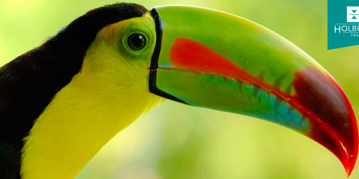
KEEL-BILLED TOUCAN