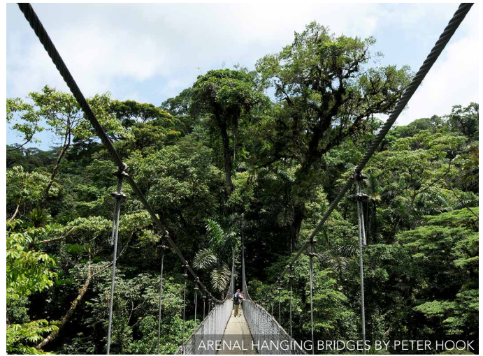
ARENAL HANGING BRIDGES BY PETER HOOK

After breakfast, take an exhilarating whitewater rafting trip on the Río Sarapiquí. A professional river guide escorts all trips, and all necessary safety equipment (helmet, life jackets, etc.) will be provided. Following a thorough safety orientation and basic rafting lesson, enjoy the Class II and III rapids of the Río Sarapiquí. This afternoon participate in a community interaction activity with the Sarapiquí Conservation Learning Center (SCLC). The SCLC is a not-for-profit organization founded to preserve the cultural integrity of the rural community of Chilamate and aid in sustainable community development projects. Return to the lodge for some free time to spend at the pool. This evening a nocturnal hike provides a comparison between wildlife during the day and night. Overnight at Selva Verde Lodge & Rainforest Reserve. (BLD)